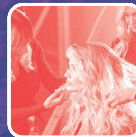
INNOVATION IN TERMS OF EDUCATION