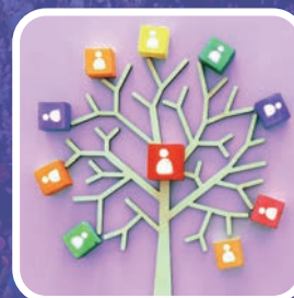
FAMILY COMPANY = FAMILY VALUES