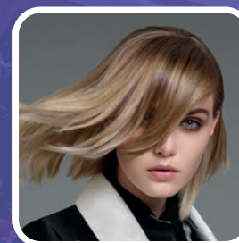
CERTAINTY OF TRADITION MATCHED WITH INNOVATION