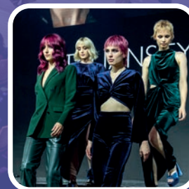
INNOVATION IN TERMS OF FASHION