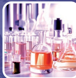
INNOVATION IN TERMS OF R&D