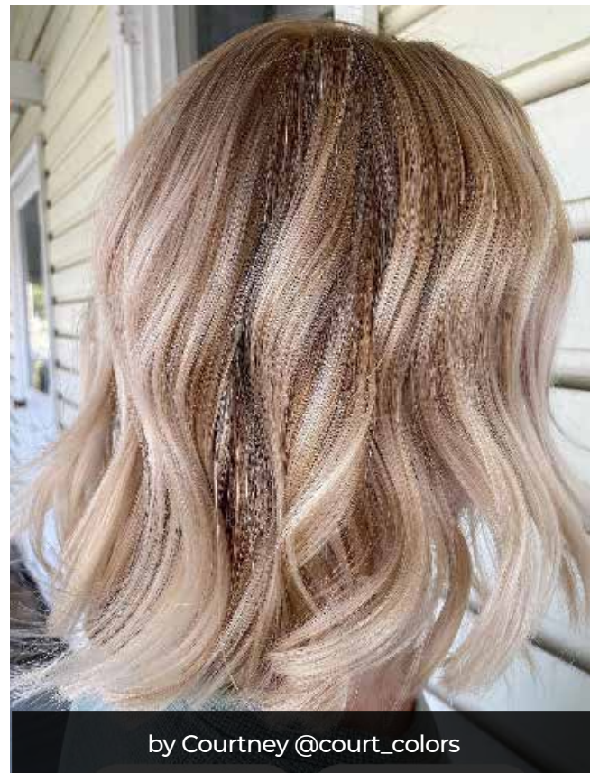
by Courtney @court_colors