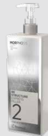
RE-STRUCTURE EXPRESS FILLER 2

gently but deeply cleanses hair, preparing it to receive the regenerating properties of hydrolyzed marine collagen and protein, combined with hydrating hyaluronic acid and vitamin E, that nourish scalp and hair.