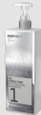
RE-STRUCTURE REVITALISING SHAMPOO 1

gently but deeply cleanses hair, preparing it to receive the regenerating properties of hydrolyzed marine collagen and protein, combined with hydrating hyaluronic acid and vitamin E, that nourish scalp and hair.