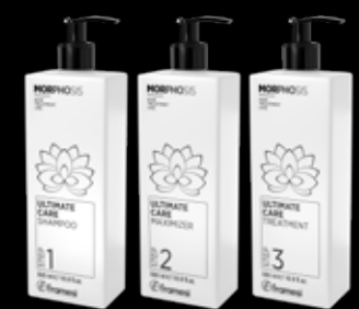
ULTIMATE CARE 1 SHAMPOO 2 MAXIMIZER 3 TREATMENT