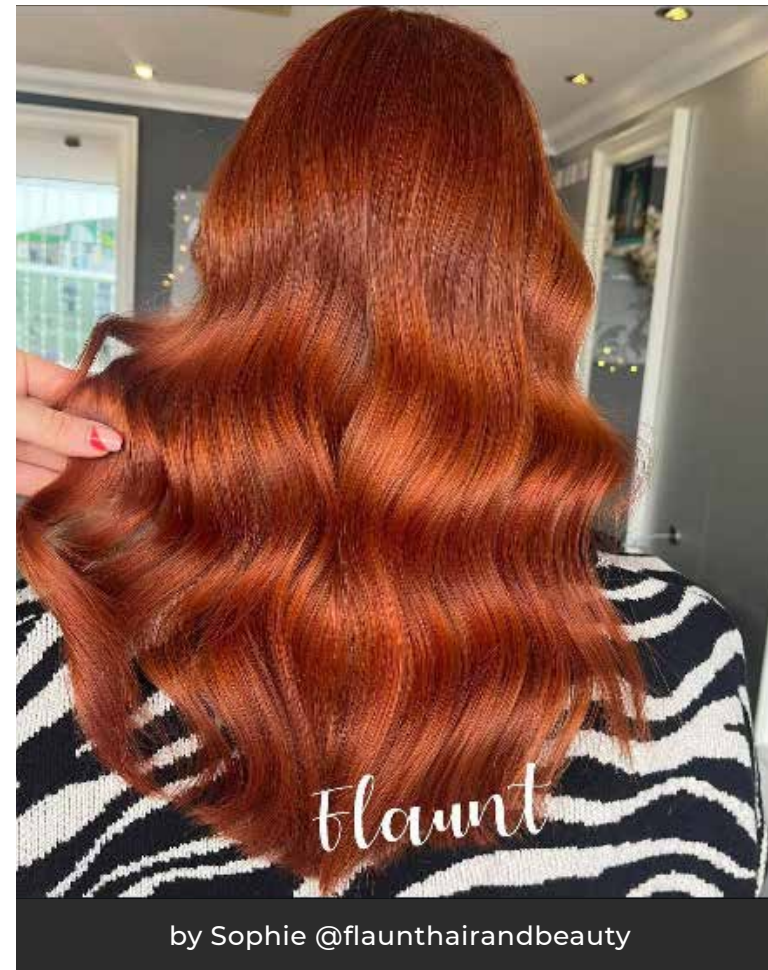
by Sophie @flaunthairandbeauty