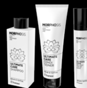
ULTIMATE CARE SHAMPOO CONDITIONER WEEKLY TREATMENT