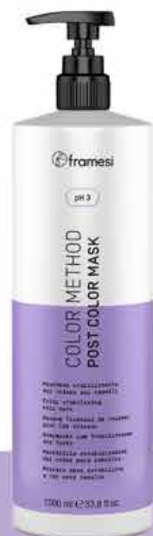
POST COLOR MASK