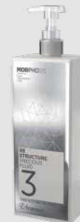
RE-STRUCTURE PRECIOUS FLUID 3

restructuring gel "fills in" and deeply repairs hair fiber with hydrolyzed marine collagen combined with hydrating hyaluronic acid and vitamin E to thicken and re-compact hair surface, instantly transforming hair texture.