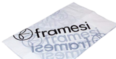
Disposable Color Capes 50 PK