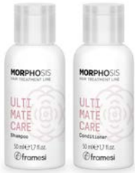
Ultimate Care Shampoo & Conditioner Minis