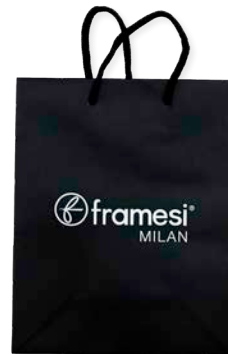
framesi Deluxe Retail Bags