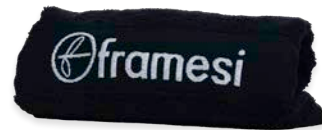
framesi Towel 12 PK