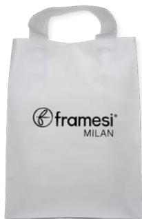
framesi Retail Bags