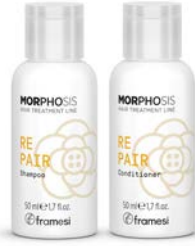
Repair Shampoo & Conditioner Minis