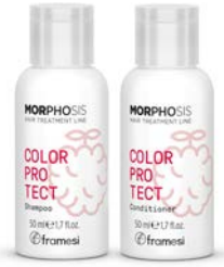
Color Protect Shampoo & Conditioner Minis

Go above & beyond to elevate your salon's image & your client's experience during MORPHOSIS SCALP AND HAIR treatments with branded MORPHOSIS accessories