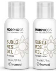
Sublimis Oil Shampoo & Conditioner Minis