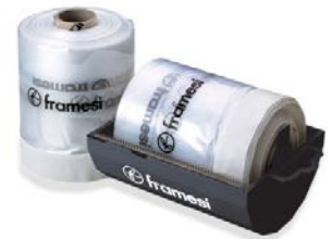
Visible Roll & Visible Dispenser