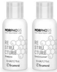
Restructure Shampoo & Conditioner Minis