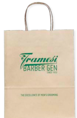
framesi Barber Gen Retail Bags