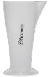
Plastic Measuring Beaker