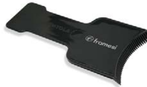
Elite la Spatola