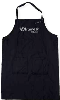
framesi Black Cutting Apron